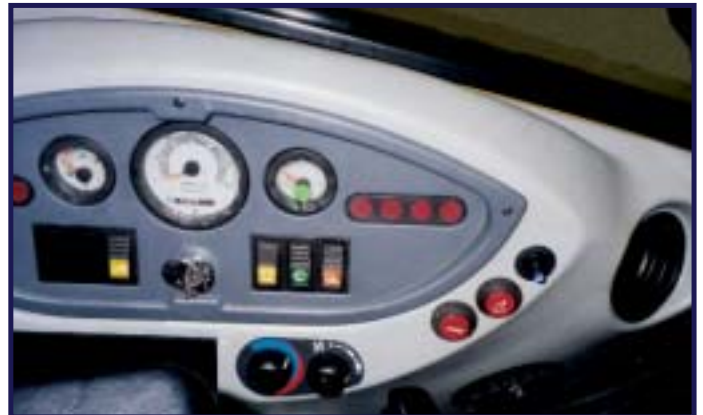
The A/C system's electrical controls are usually dash mounted in existing factory locations.

Complete with step-by-step instructions, our kits are ready for dealer or end user installation. The end result is a quality a/c system that is custom designed to meet your needs – and save you money.