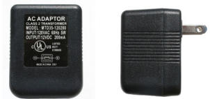
front view side view